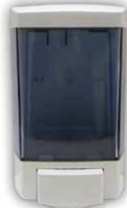
5335 / 5344