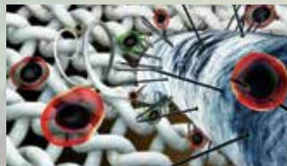
In this magnified view, the positively charged surface of MicroGard® attracts the negative charged bacteria. Due to the electrical attraction, the bacteria is drawn into the molecular spikes which puncture the bacteria membrane, eliminating it.