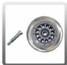
10-0303 Rollerblade Wheel for Spotter