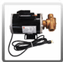
10-0800 Flood Pumper Pump