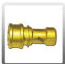
10-0868 1/4 in. Female Quick Disconnect