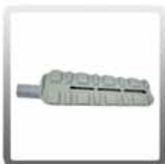
10-0440 14 in. Quick Clean Paddle (for Pews and Benches)