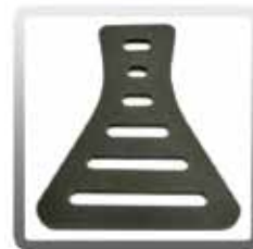
10-0020 Cushioned Back Pad