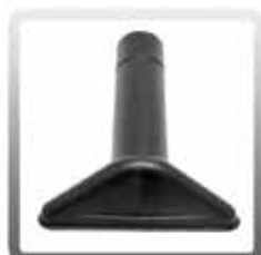
10-0031 5 in. Upholstery Tool