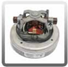
10-0346-COM DP Hipster Motor with Gasket for Hipsters