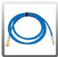
80-8007-A 15 ft. Solution Hose Assembly with 1/4 in. Female and Male Quick Disconnects