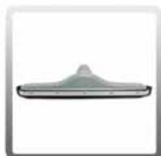
10-0170 14 in. Squeegee Floor Tool