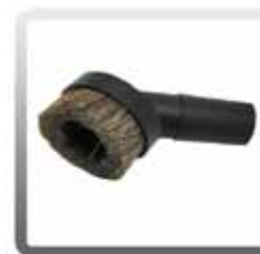
10-0037 3 in. Round Dust Brush