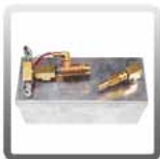
10-0910-2-5 2000 Watt Heater for 500 PSI Extractor