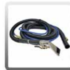
80-8010 4 in. Stainless Steel Upholstery Tool with 15 ft. Vacuum and Solution Hoses