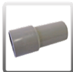
10-0155 Straight Hose Cuff