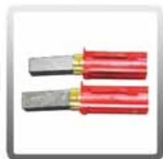
10-1333-O Orange WHISPER Motor Brushes, 2-Stage (Set of 2)