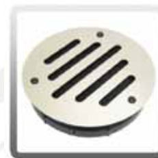
10-0008-B Complete Dome Filter with Bag Support