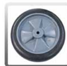
10-0807 10 in. Wheel for Extractor