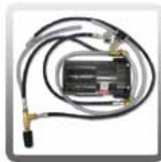
80-0112 1200 PSI Pump Kit for 1200 PSI Extractor Only