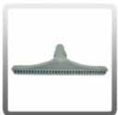
10-0430 15 in. Smooth Glide Carpet Brush