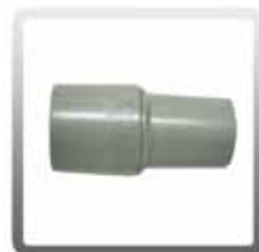
10-0195 Swivel Cuff (1-1/2 in. Diameter)