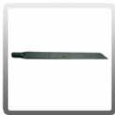
10-0181 28 in. Crevice Tool