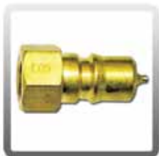
10-0870 1/4 in. Male Quick Disconnect