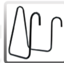
HOSE HANGER Hose Hanger for Extractors