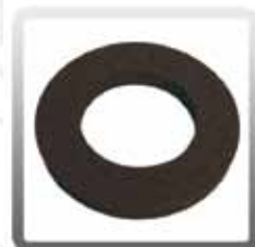
10-1030 Spotter Motor Gasket for 2-Gallon and 3-Gallon Spotters