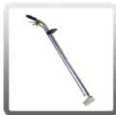
80-8008 12 in. Stainless Steel Single Bend 1-Jet Wand