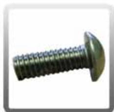
10-0022 Screw for Shoulder and Waist Belt