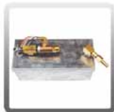
10-0910-2-1 2000 Watt Heater for 100 PSI Extractor