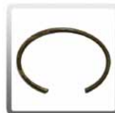
10-0165 Copper Ring 3-Piece Head Kit