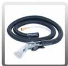
10-0401-I 4 in. Clear View Plastic Upholstery Tool with Internal 7 ft. Hoses for machines WITHOUT Heat