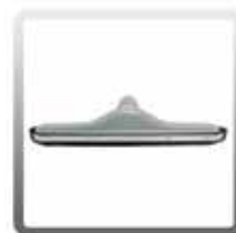
10-0170 14 in. Squeegee Floor Tool