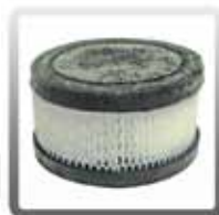
60-0007 HEPA Filter Replacement