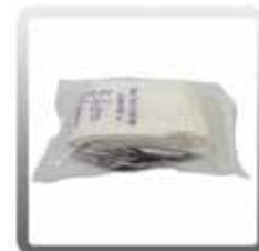
10-0197 6-Quart Vacuum Micro- Lined Filter Bag (10 Pack)