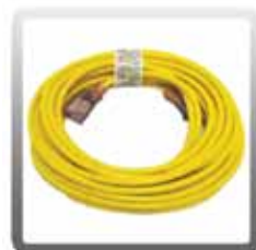
10-0028 50 ft. Electrical Cord with Lit Ends