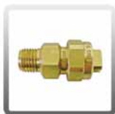
80-0007 #1 Tip for Dual Jet Extractor Wand