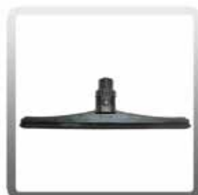
10-0185-N 18 in. Sidewinder Nylon Floor Tool