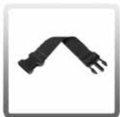
10-0497 Hipster Waist Belt Extension (Extends up to 12 in.)