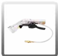
10-0500-E 4 in. Clear View Plastic Upholstery Tool for External Hoses for Machines WITHOUT Heat