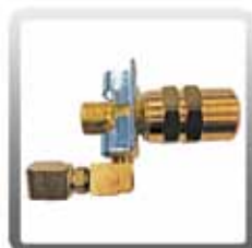
10-0869-REG 200 PSI Pump Regulator