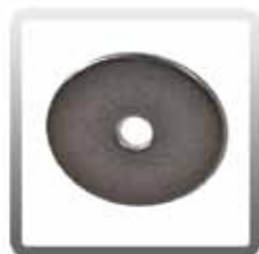
10-0023 Washer for Shoulder and Waist Belt