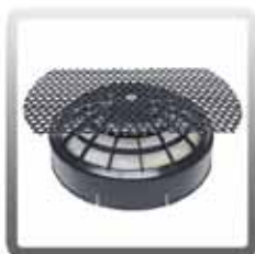
10-0219-6 Complete HEPA Filter with Bag Support for 6-Quart HEPA Backpack