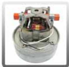
10-0012-COM WHISPER 2-Stage Motor with Gasket