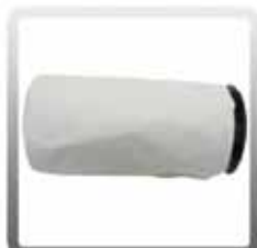
10-0007-6 6-Quart Vacuum Cloth Filter Bag with L-Style Grommet