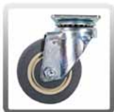
10-0808 Caster for Extractor