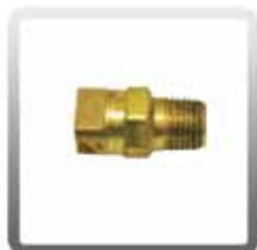
10-0502 Jet for 4 in. Stainless Steel Upholstery Tool