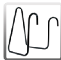
HOSE HANGER Hose Hanger for Extractors