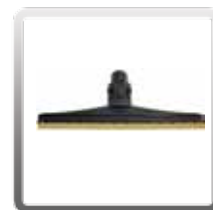
10-0185-15-S 15 in. Sidewinder Squeegee Floor Tool