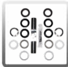
80-0080-RA 300 PSI Pump Rebuild Kit A Plunger and Seals