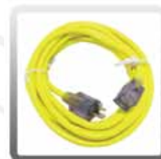
10-0860 25 ft. Extension Cord for Extractors