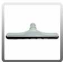
10-0472 14 in. Easy Glide Carpet and Floor Tool