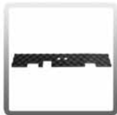
10-0018 Sound Dampening Band