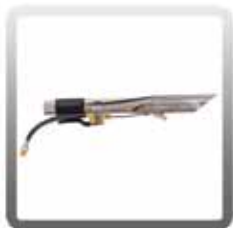
10-0512 Stainless Steel Crevice Tool for External Hoses (for Indy Line)