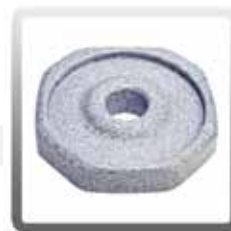
10-0002-6-A Vacuum Lid for 6-Quart Backpack