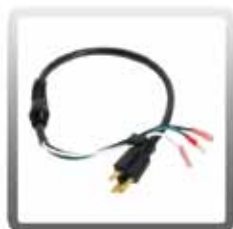
10-0026-A 17 in. Complete Pigtail Cord with Strain Relief Nut and Electrical Connectors