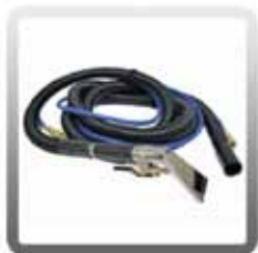
80-8010-SP 4 in. Stainless Steel Upholstery Tool with 15 ft. External Vacuum and Solution Hoses