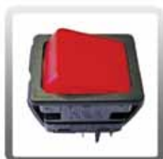
10-0803-H Lighted On/Off Heater Switch for Extractor