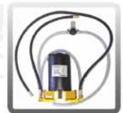
80-0800 800 PSI Pump