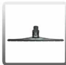
10-0185 18 in. Sidewinder Carpet Tool