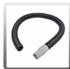
10-0024-COM Complete 4 ft. Vacuum Hose with Cuff for 10-Quart (1-1/2 in. Diameter)