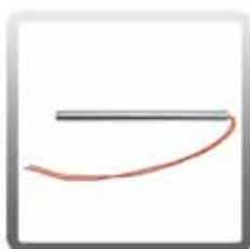
10-1500-B 600 Watt Heater Element