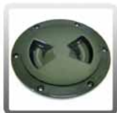
10-0302 5 in. Hatch Cover for 2-Gallon Solution Tank