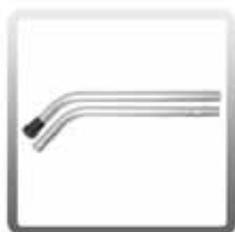
10-0029 56 in. 2-Piece, 2-Bend Aluminum Wand with 3-Piece Head Kit