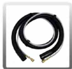
10-0450-A 7 ft. Vacuum and Solution Hoses (External)