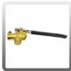
80-0505 Valve for Single and Dual Jet Extractor Wands