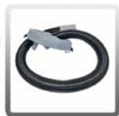
10-0002-B Complete Vacuum Lid with Hose and Cuff for 10-Quart Backpack