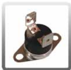
10-0814 Sensor for Heater