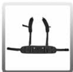
10-0021 Shoulder and Waist Belt