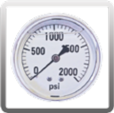
80-0059-4 1200 PSI Extractor Gauge