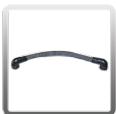
80-0003-C 28" Black/Gray Hose Assembly with Cuffs and Steel-Type Inserts