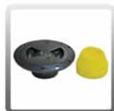
10-0304 Spotter Cap and Float Assembly for 3-Gallon Spotter