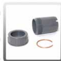
10-0223-B 3-Piece Head Kit for Wand