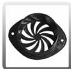
10-0822 Intake/Exhaust Grate