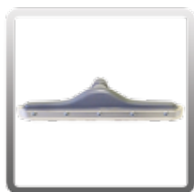
10-0488 14 in. White Blade Squeegee Floor Tool