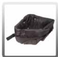
10-0021-BA Deluxe Padded Waist Belt for Backpacks Only (not for Hip Vacuums)