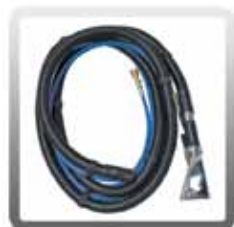
10-0503 4 in. Stainless Steel Upholstery Tool and 7 ft. External Vacuum and Solution Hoses