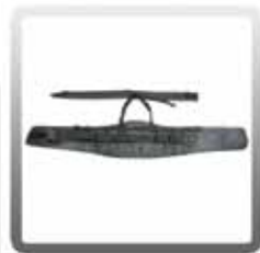
10-0421 Waist Belt for 6-Quart Hipster