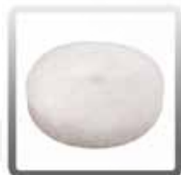
60-0006 Round Filter Replacement