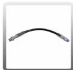
10-0507 8 in. Black Hose for 4 in. Stainless Steel Upholstery Tool