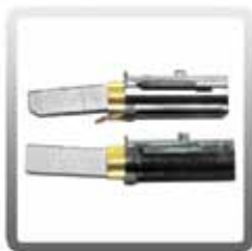
10-1333 Black Super Motor Brushes, Single Stage (Set of 2)