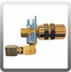
80-0080-REG 300 PSI Pump Regulator