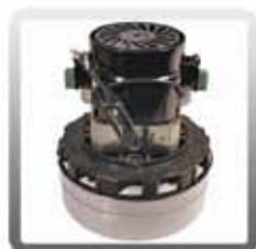
10-0366-COM 3-Gallon Super Spotter Motor with Gasket