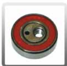
10-0869-RC 200 PSI Pump Rebuild Kit C Bearing