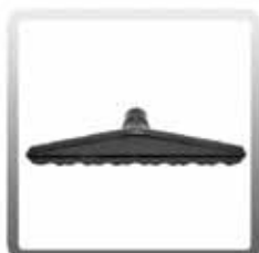
10-0032-C Complete 14 in. Scalloped Floor Tool with Bumper