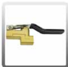
10-0504 Valve for 4 in. Stainless Steel Upholstery Tool