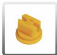
10-0499-A Tee Jet for 4 in. Clear View Upholstery Tool