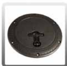
10-0804-COM 6 in. Hatch Cover for Extractor with T-Handle and Gasket