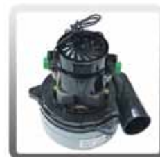
10-0811-COM 2-Stage Extractor Motor with Gasket, 120 V