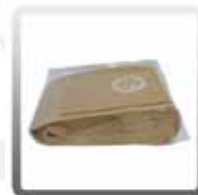
60-1001 FORCE 14 Replacement Paper Bags (10 Pack)