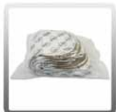
10-0006-HEPA 10-Quart Vacuum HEPA Micro-Lined Filter Bag (10 Pack)