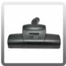
10-2507 1-1/4 in. Turbo Brush

TIP: The 10-Quart Backpack Vacuum's static dissipating vacuum hose is angled into the lid at a 45 degree angle. This prevents bending and breaking. The hose also twists in and swivels, allowing for right- or left-handed vacuuming and prevents clogging.