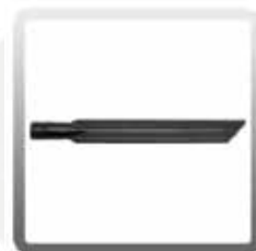
10-0033 17 in. Crevice Tool