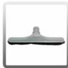
10-0183 14 in. Nylon Brush Hardwood Floor Tool