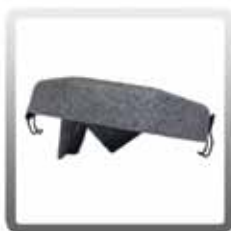
10-0002-A Complete Vacuum Lid for 10-Quart Backpack (NO Hose)