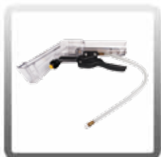
10-0500-I 4 in. Clear View Plastic Upholstery Tool for Internal Hoses for Machines WITHOUT Heat