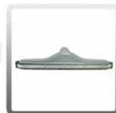
10-0173 14 in. Felt Floor Tool