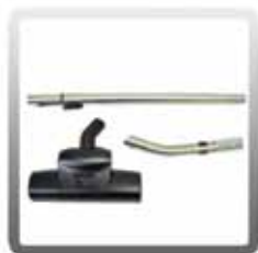
10-2300 Turbo Brush Kit, Includes Telescopic Wand, 1-1/2 in. to 1-1/4 in. Hose Handle