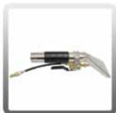
10-0501 4 in. Stainless Steel Upholstery Tool, Required for Machines with Heat