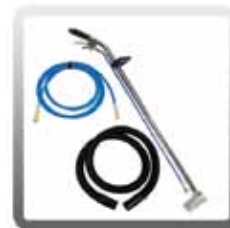
80-8009-A 12 in. Stainless Steel Single Bend, 1-Jet Wand with 15 ft. Vacuum and Solution Hoses