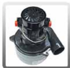
10-0810-COM 3-Stage Extractor Motor with Gasket, 120 V