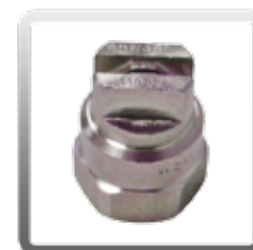
80-0007-B #2 Tip for a Single Jet Extractor Wand