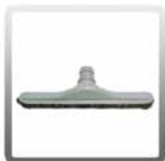
10-0438 14 in. Slotted Horse Hair Carpet Brush