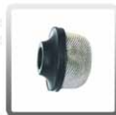
10-0845 1/4 in. Strainer