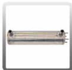
10-0900 Single Rod Heater Exchanger Tube for Spotter