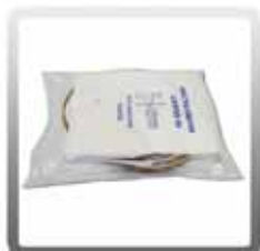
10-0006 10-Quart Vacuum Micro-Lined Filter Bag (10 Pack)