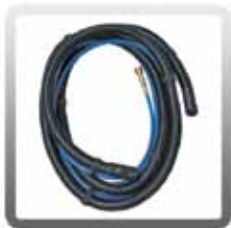
80-8011 15 ft. Vacuum and Solution Hoses with 1-1/4 in. Straight Cuffs, NO Upholstery Tool