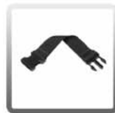
10-0409 Backpack Waist Belt Extension (Extends up to 12 in.)