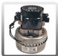
10-0354-COM 3-Gallon Spotter Motor with Gasket