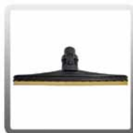
10-0185-15-S 18 in. Sidewinder Squeegee Tool