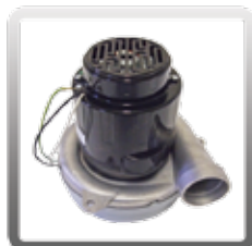
10-0811-66-COM 2-Stage 6.6" Extractor Motor, 120 V