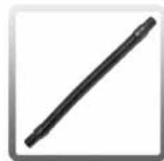
10-0036 Complete 4 ft. Super Flex Vacuum Hose with Cuffs (1-1/2 in. Diameter)