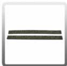
10-0173-A Replacement Blades for 14 in. Felt Floor Tool