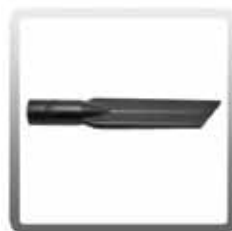
10-0345 11 in. Crevice Tool