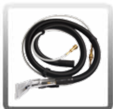
10-0401-E 4 in. Clear View Plastic Upholstery Tool with External 7 ft. Hoses for machines WITHOUT Heat