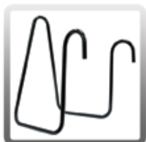
HOSE HANGER Hose Hanger for Extractors