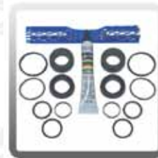
80-0112-RA 1200 PSI Pump Rebuild Kit A Plunger and Seals