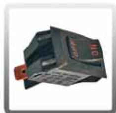
10-0025 On/Off Switch for Backpacks