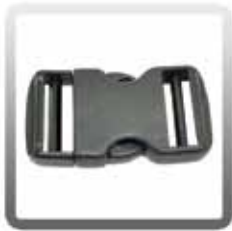
10-0372 Waist Belt Clip for Backpack Vacuum