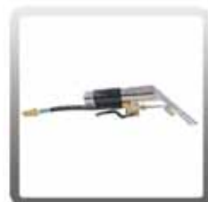
10-0508 4 in. Stainless Steel Upholstery Tool with Clear View Head for External Hoses