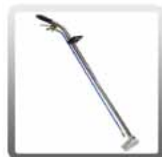
10-0455 Stainless Steel Spotter Wand with Blue 3000 PSI Hose and #2 Jet