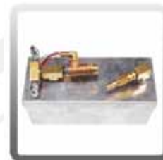
10-0910-2-3 2000 Watt Heater for 300 PSI Extractor