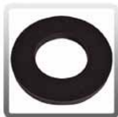
10-1030-S2 2-Stage Motor Gasket