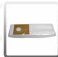
60-1001-HEPA FORCE 14 HEPA Replacement Paper Bags (10 Pack)