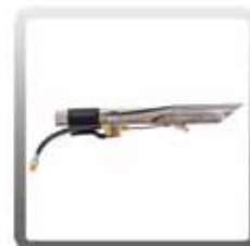
10-0512 Stainless Steel Crevice Tool