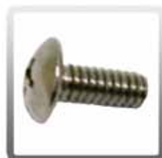
10-0055-S Short Screws for Bottom of Hipster Waist Belt