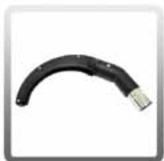
10-0176-A 4 in. to 8 in. Overhead Pipe Cleaner Wand Attachment