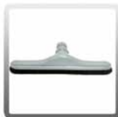
10-0441 14 in. Horse Hair Hardwood Floor Brush