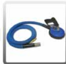
10-0874 7 in. Hard Surface Turbo Brush Tool