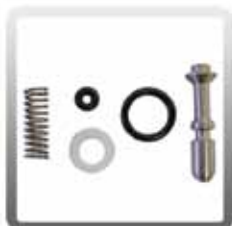
10-0504-A Repair Kit for 4 in. Stainless Steel Upholstery Tool Valve