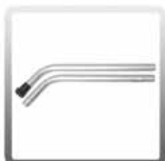
10-0029 56 in. 2-Piece, 2-Bend Aluminum Wand with 3-Piece Head Kit