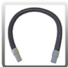
10-0024-6-COM Complete 4 ft. Vacuum Hose with Cuffs for 6-Quarts (1 Swivel and 1 Straight)