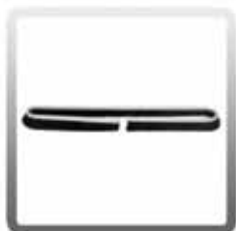
10-0441-A Replacement Brushes for 14 in. Horse Hair Brush