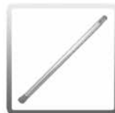
10-0454 36 in. Aluminum Vacuum Wand Extension