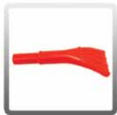
10-0177 4 in. Car Utility Tool