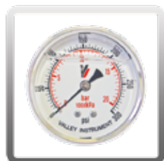
80-0059-2 200 PSI Extractor Gauge