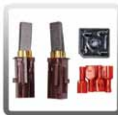
10-0042 Aviation Backpack 400 Hz Motor Brush Kit (Set of 2)