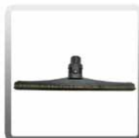
10-0185-H 18 in. Sidewinder Horsehair Floor Tool