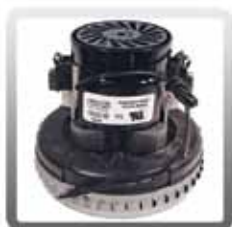
10-0447-COM 2-Gallon Spotter Motor with Gasket