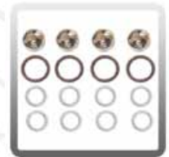
80-0112-RB 1200 PSI Pump Rebuild Kit B Valve and Seals