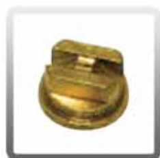
80-0007-A #1 Tip for a Single Jet Extractor Wand