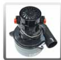
10-0825-COM Flood Pumper Motor with Gasket