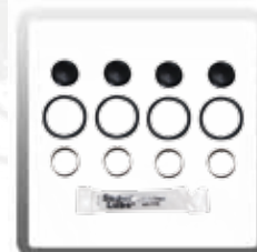
10-0869-RB 200 PSI Pump Rebuild Kit B Valve and Seals