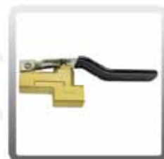
10-0504 Valve for Stainless Steel Upholstery Tool for Part Number 10-0501