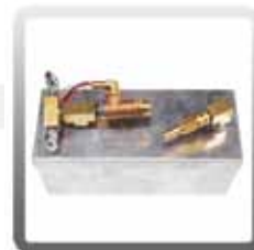
10-0910-2-2 2000 Watt Heater for 200 PSI Extractor