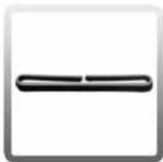
10-0183-A 14 in. Replacement Brush for Nylon Floor Tool