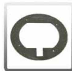
10-0199 Vacuum Motor Gasket