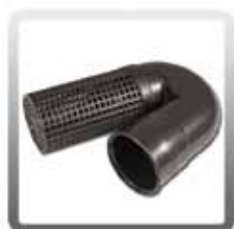
80-0012 Shut-Off Assembly