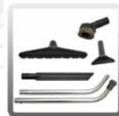
10-0034 Standard 5-Piece Tool Kit