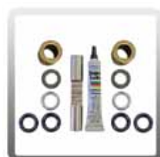
80-0016-RA 500 PSI Pump Rebuild Kit A Plunger and Seals