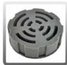
10-0019 10-Qt. Dual Cell Noise Filter 10-0019-6 6-Qt. Dual Cell Noise Filter