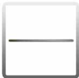
10-0184 59 in. 2-Piece Sidewinder Wand