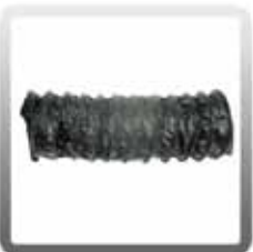
T-A001-1 Cooling Ducting