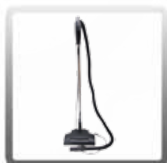
10-0163 Power Head Kit, Includes Wand, Electrical Fittings and Vacuum Head