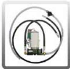
80-0080 300 PSI Pump for Extractor