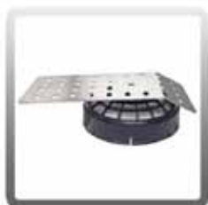
10-0219-H Complete HEPA Filter with Bag Support for 6-Quart HEPA Hipster