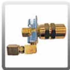
80-0112-UN 1200 PSI Unloader Valve Regulator