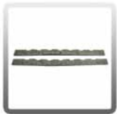
10-0340-A 14 in. Felt Replacement Blades for 14 in. Scalloped Felt Floor Tool