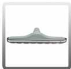
10-0340 14 in. Scalloped Felt Floor Tool