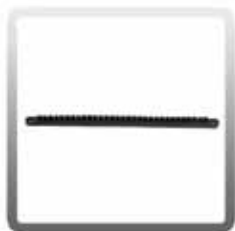
10-0175-A Replacement Brushes for 16 in. Carpet Tool with Adjustable Brush