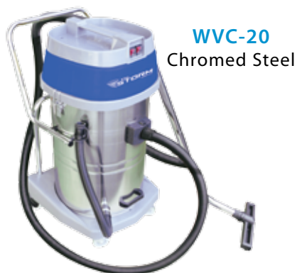
VVC-20 Chromed Steel