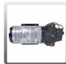
10-0812 100 PSI Pump