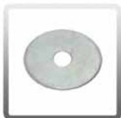
10-0217 Washer for Waist Belt for 6-Quart Backpacks and Hipsters