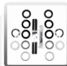
10-0869-RA 200 PSI Pump Rebuild Kit A Plunger and Seals