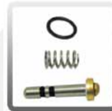
80-0505-A Valve Repair Kit for Valve on Single and Dual Jet Wands