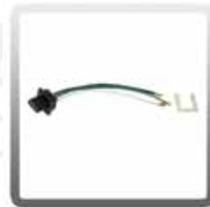
10-0422 Power Head Connector Kit