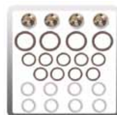
80-0016-RB 500 PSI Pump Rebuild Kit B Valve and Seals