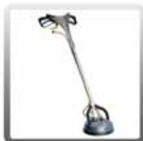
10-0859 12 in. Hard Surface Turbo Brush Tool