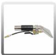
10-0501 4 in. Stainless Steel Upholstery Tool for use with External Hoses for Machines with or without Heat