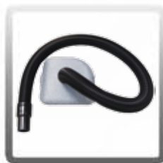
10-0002-H-LID Complete Hipster Lid with Hose and Cuff