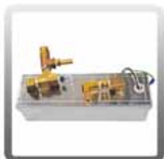
10-0910-SP 600 Watt Heater for Spotter