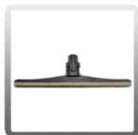
10-0185-F 18 in. Sidewinder Felt Floor Tool