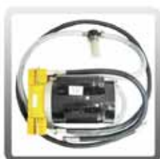
80-0016 500 PSI Pump