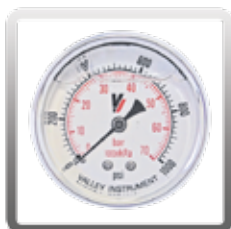
80-0059 500 PSI Extractor Gauge