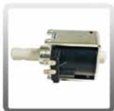
10-0300 55 PSI Pump for 2-Gallon and 3-Gallon Spotters