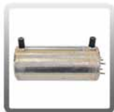
10-0920 Dual Rod Heat Exchanger Tube for Extractor