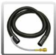
10-0450 7 ft. Vacuum and Solution Hoses (Internal)