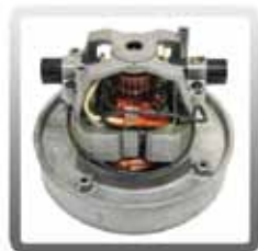
10-0013-COM Super 1-Stage Motor with Gasket