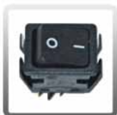
10-0803 On/Off Switch for Extractor