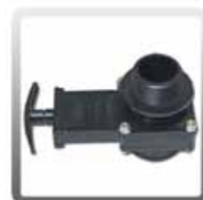
10-0805 Dump Valve