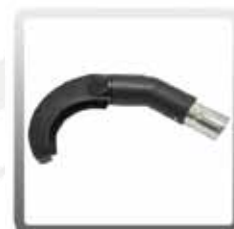
10-0176 1 in. to 4 in. Overhead Pipe Cleaner Wand Attachment