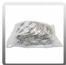
10-0197-HEPA 6-Quart Vacuum HEPA Micro-Lined Filter Bag (10 Pack)