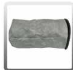
10-0007-10 10-Quart Vacuum Cloth Filter Bag with L-Style Grommet