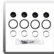
80-0080-RB 300 PSI Pump Rebuild Kit B Valve and Seals