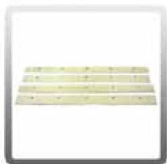
10-0489 White Replacement Blades for 14 in. Squeegee floor Tool (4 Pack)