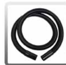
50-1008-A Complete 15 ft. Vacuum Hose Assembly (1-1/4 in.)