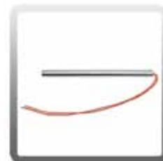
10-1500-A 1000 Watt Heater Element