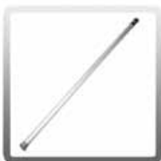
10-0342-A 60 in. Straight Extension Aluminum Wand