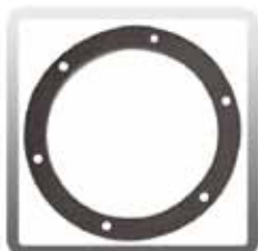
10-0302-A 5 in. Gasket for Hatch Cover for 2-Gallon and 3-Gallon Spotters