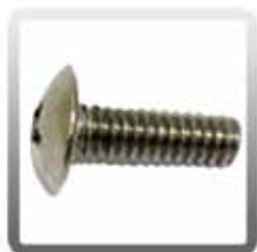
10-0055-L Long Screws for Top of Hipster Waist Belt