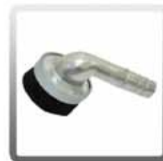
10-0220 5 in. Aluminum Dust Brush