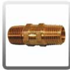
80-0101-M 1/4 in. Male Brass Check Valve