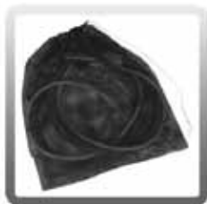
80-0510 Black Mesh Utility Bag (24 x 36)