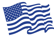
5. Converting in U.S.A.