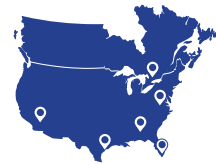
6. North America Distribution